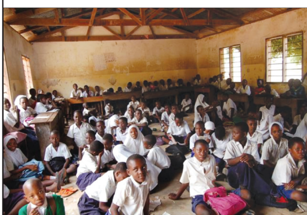
Figure 2: Many pupils still sit on the floor at school

Put differently, with 51 pupils per teacher, it can be estimated that the Government spends about TZS 7.8 million per teacher per annum. Of this amount a significant share is paid in teachers' salaries. At an average salary of TZS 300,000 per month, or TZS 3.6 million per teacher per year, it is estimated that the Government spends approximately 46 percent of its education budget on teachers' salaries. This leaves 54 percent of the budget or about TZS 4.2 million per teacher per year, for allocation to other items. How is this money spent?